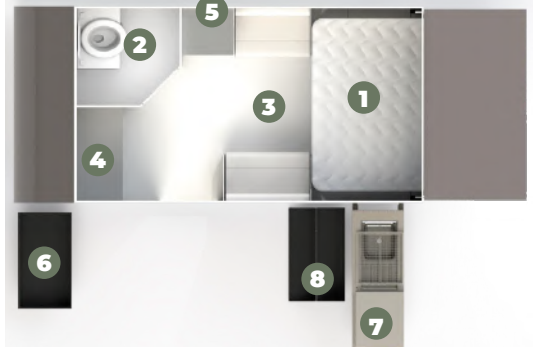
FLOOR PLAN SHOWN: OPTION ONE