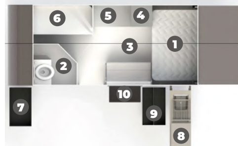
FLOOR PLAN SHOWN: OPTION ONE