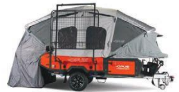
Aerial view with annex & roof rack installed