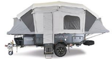
Aerial view with annexe & roof rack installed