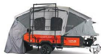
Aerial view with annexe & roof rack installed